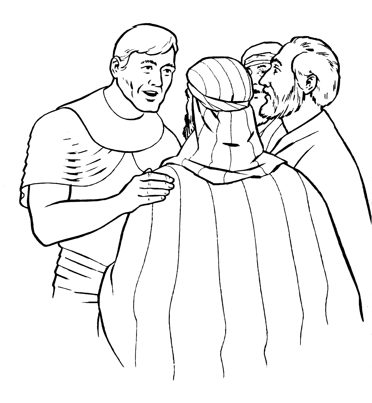
Joseph tells his brothers who he is!