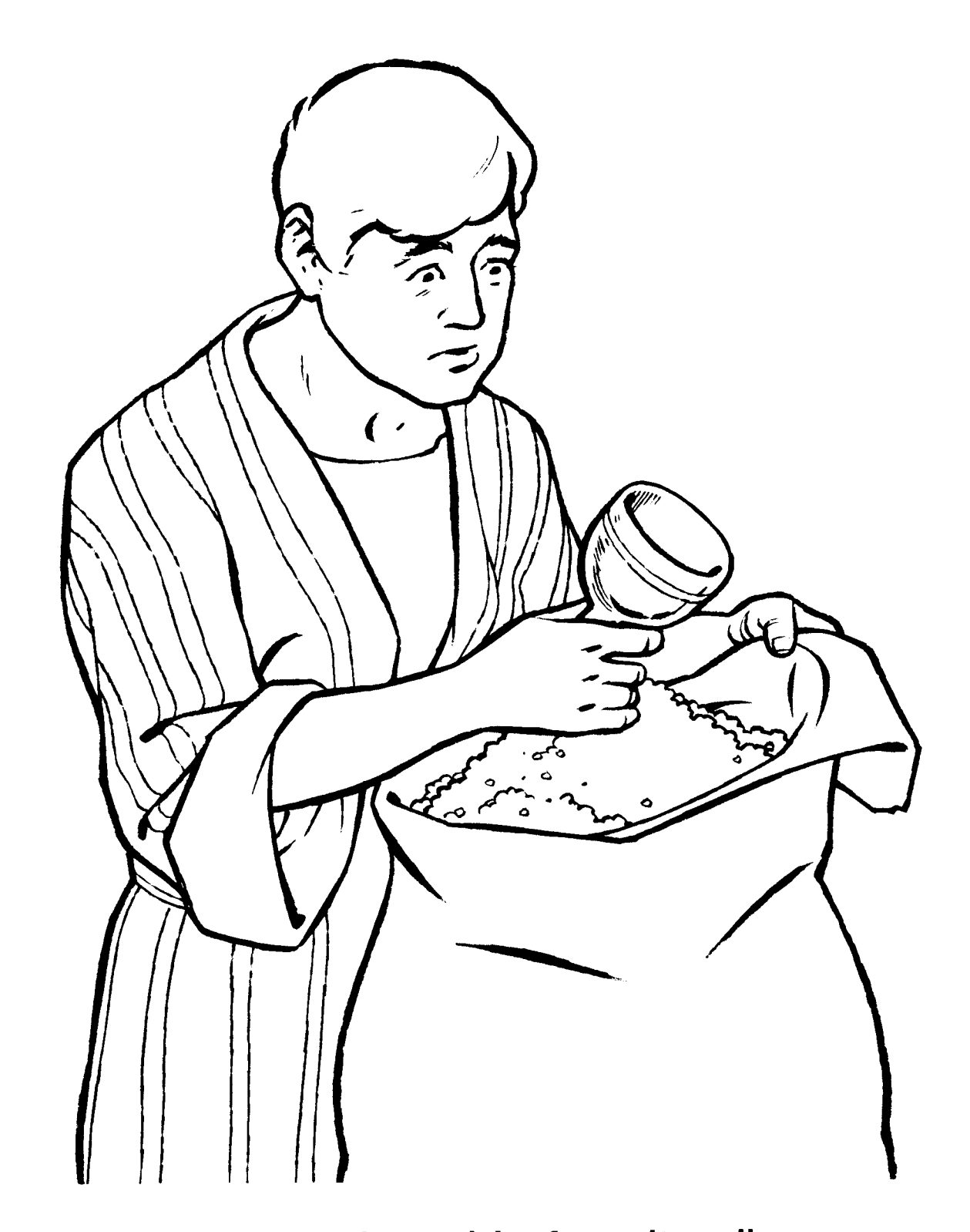
Benjamin finds Joseph's favorite silver cup in his sack of grain!

Parents: Explain why Joseph had his silver cup placed in Benjamin's sack of grain.